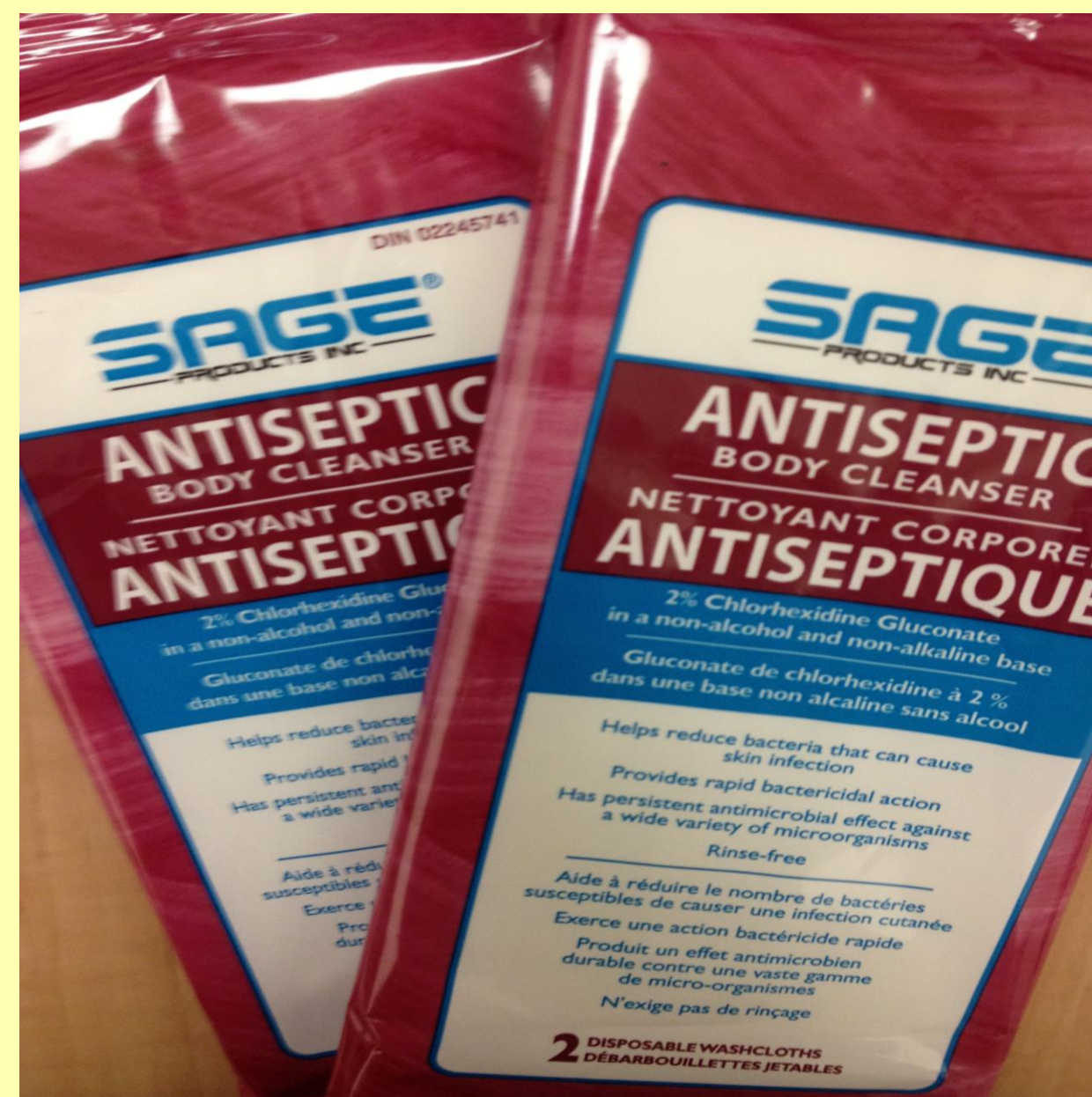
Cloths containing 2% chlorhexidine gluconate were given to study participants to wash the surgical site the night before and morning of surgery.